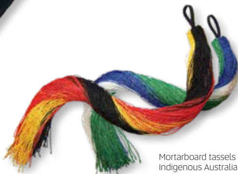
Mortarboard tassels for Indigenous Australian graduates