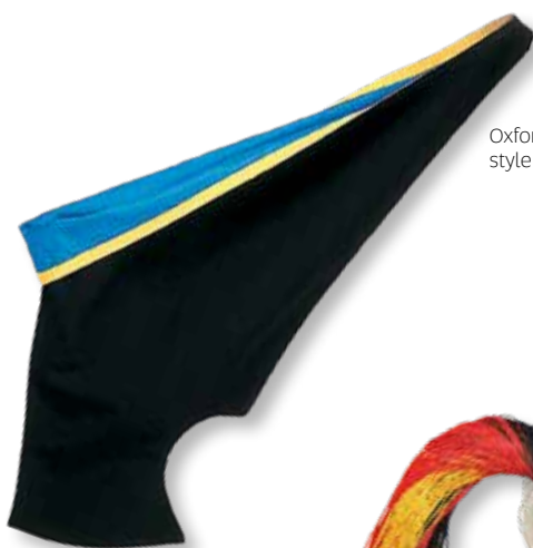
Oxford burgon style hood

The University of South Australia is no exception. In 1991, the University acknowledged the academic dress of its predecessor institutions and then in February 1992, the University's academic dress was determined by the Council and the first graduation ceremonies wearing the new University of South Australia academic dress occurred during April 1992. It is interesting to note that the hood chosen is of Oxford Burgon style while the gown is of the Cambridge style, an interesting link with two of the greatest European universities of the Middle Ages.