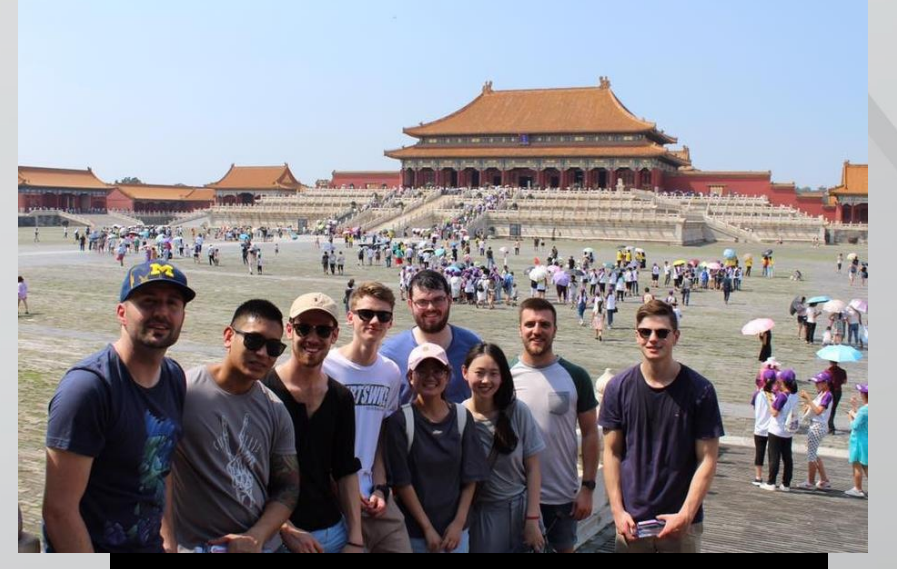
2017 BNU Summer School - China