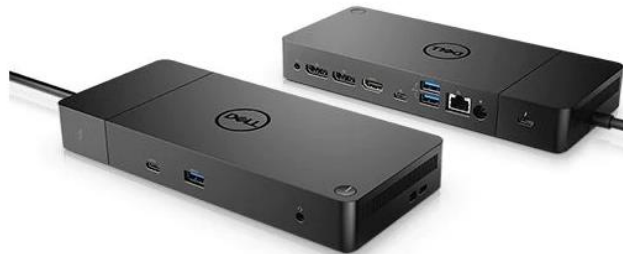
Figure 1 (above) – Dell WD19 Dock