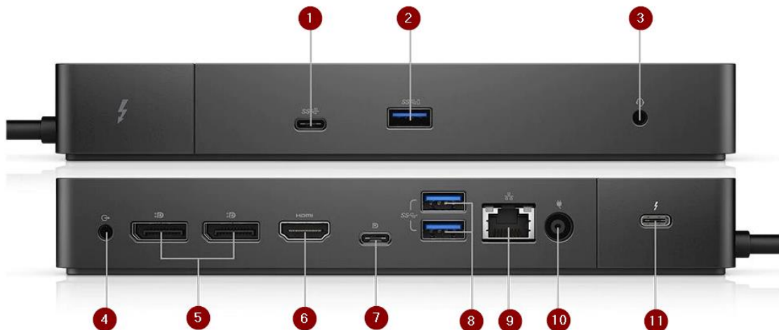
Figure 2 (above) – Dell WD19 Dock connections

This dock can connect up to three monitors via two native Displayport (5) and one HDMI (6) connector