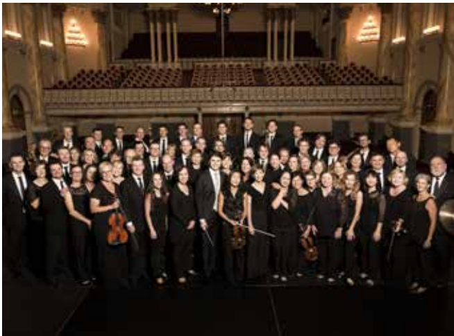
Adelaide Symphony Orchestra