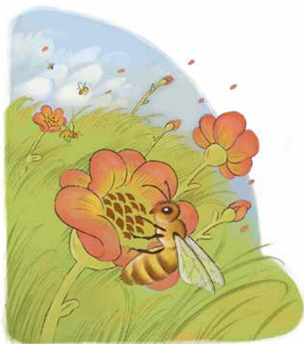
Gemma Masonr Busy Bee. Digital Illustration