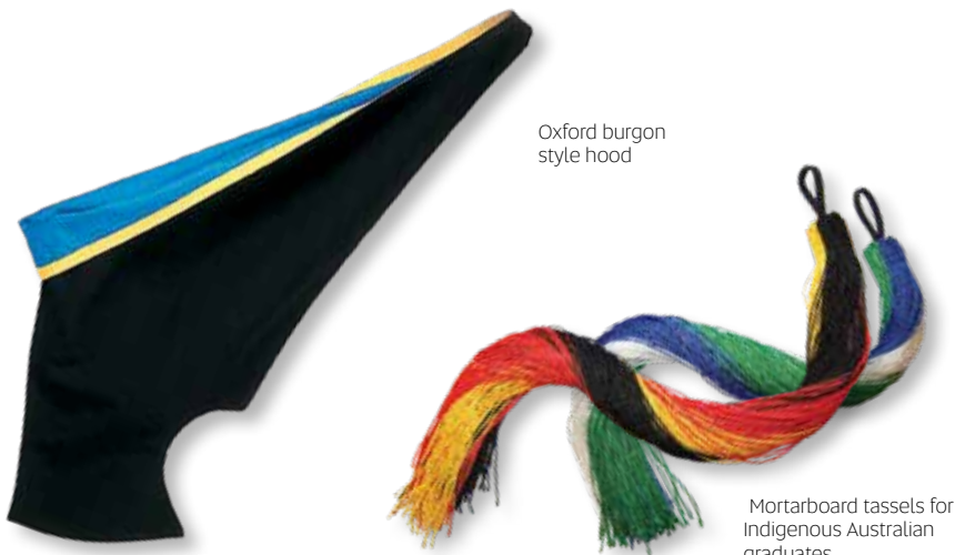
Oxford burgon style hood

The University of South Australia is proud of its commitment to Australian reconciliation. To enable Indigenous Australians to have their ancestry recognised, Aboriginal and Torres Strait Islander graduates have the option of wearing a mortarboard with a tassel incorporating the colours of the respective flags (red, black and yellow for Aboriginal graduates and blue, green and white for Torres Strait Islander graduates).