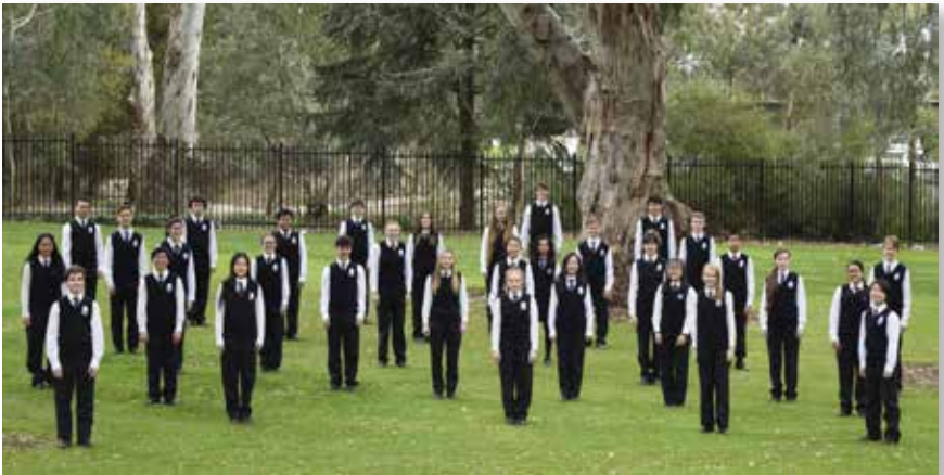
The Marryatville Concert Choir