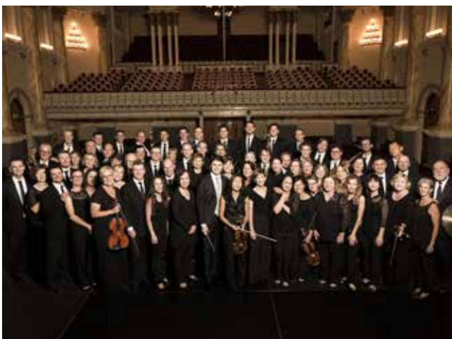
Adelaide Symphony Orchestra