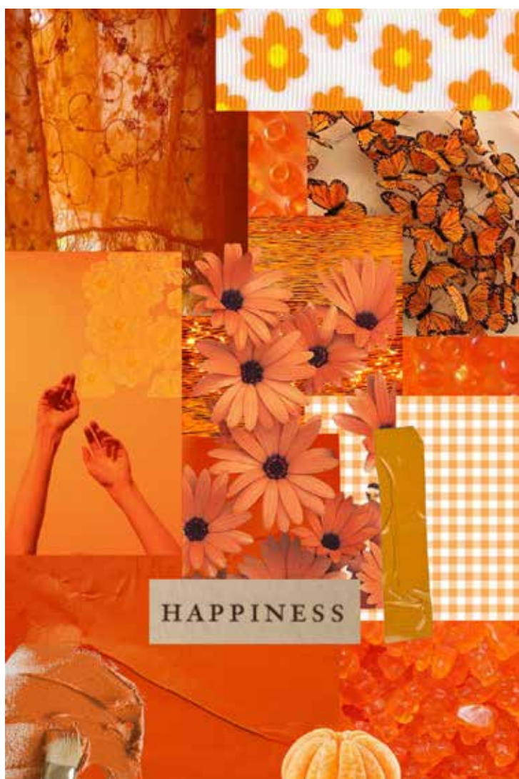
Lillee Wakefield Happiness, 2023 Digital collage