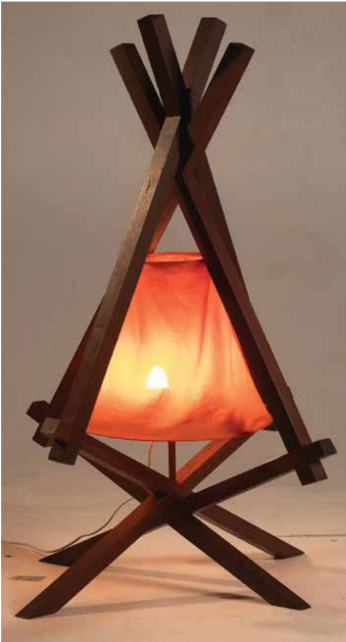
Jared Garfoot Lamp