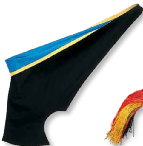
Oxford burgon style hood

The University of South Australia is proud of its commitment to Australian reconciliation. To enable Indigenous Australians to have their ancestry recognised, Aboriginal and Torres Strait Islander graduates have the option of wearing a mortarboard with a tassel incorporating the colours of the respective flags (red, black and yellow for Aboriginal graduates and blue, green and white for Torres Strait Islander graduates).