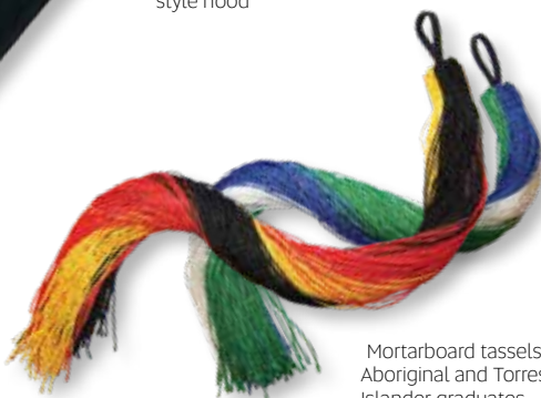
Mortarboard tassels for Aboriginal and Torres Strait Islander graduates