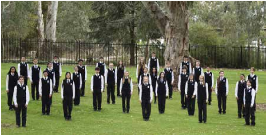
The Marryatville Concert Choir

Deborah Cheetham, Yorta Yorta woman, soprano, composer and educator has been a leader in the Australian arts landscape for more than 25 years. In the 2014 Queen's Birthday Honours List, Deborah was appointed as an Officer of the Order of Australia (AO), for distinguished service to the performing arts as an opera singer, composer and artistic director, to the development of Indigenous artists, and to innovation in performance.