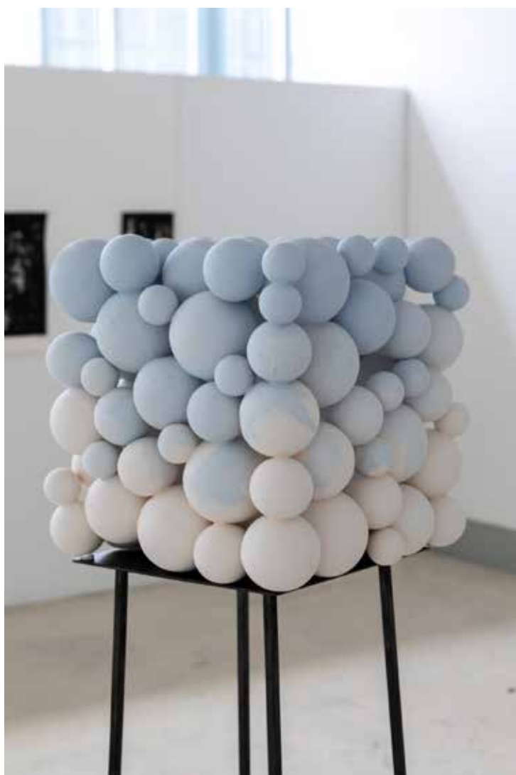
Peter Fitton The Cube, 2021. Earthenware ceramic.