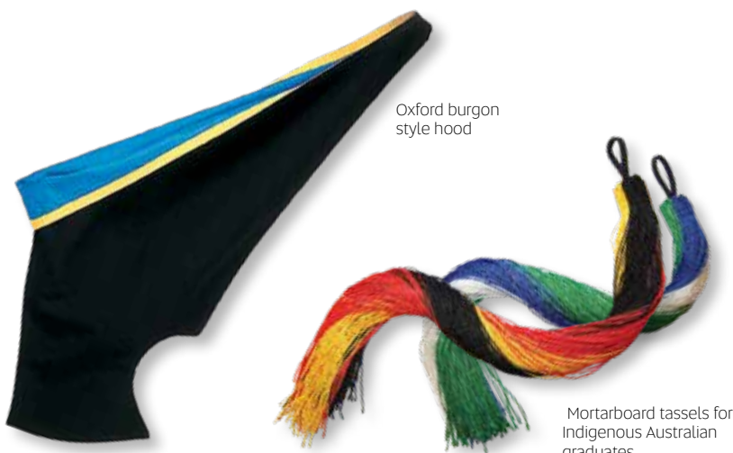
Oxford burgon style hood

The University of South Australia is proud of its commitment to Australian reconciliation. To enable Indigenous Australians to have their ancestry recognised, Aboriginal and Torres Strait Islander graduates have the option of wearing a mortarboard with a tassel incorporating the colours of the respective flags (red, black and yellow for Aboriginal graduates and blue, green and white for Torres Strait Islander graduates).