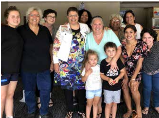
The Ngarrindjeri Women's Choir