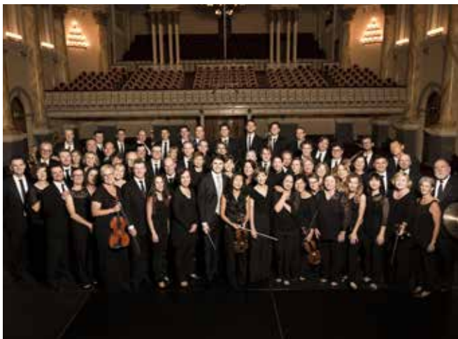
Adelaide Symphony Orchestra