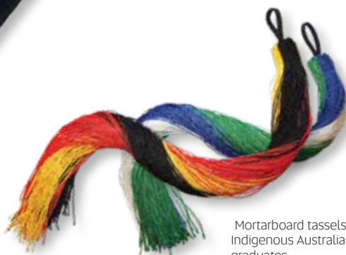
Mortarboard tassels for Indigenous Australian graduates