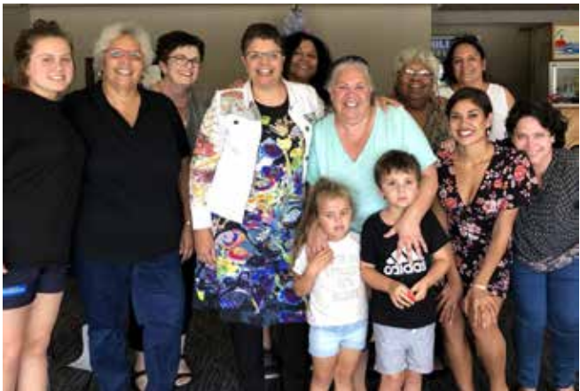
The Ngarrindjeri Women's Choir