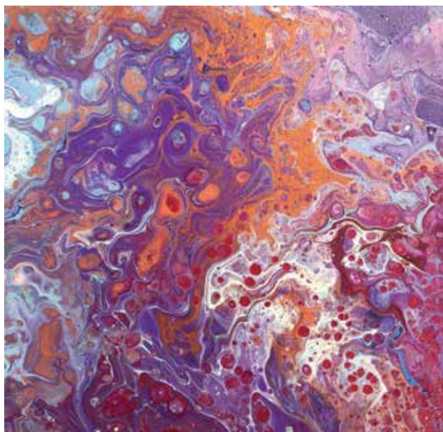
Caitlin Ralston Violet Flows 2018