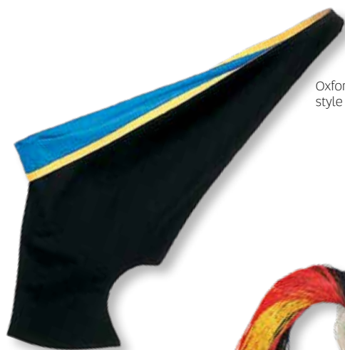
Oxford burgon style hood

The University of South Australia is no exception. In 1991, the University acknowledged the academic dress of its predecessor institutions and then in February 1992, the University's academic dress was determined by the Council and the first graduation ceremonies wearing the new University of South Australia academic dress occurred during April 1992. It is interesting to note that the hood chosen is of Oxford Burgon style while the gown is of the Cambridge style, an interesting link with two of the greatest European universities of the Middle Ages.