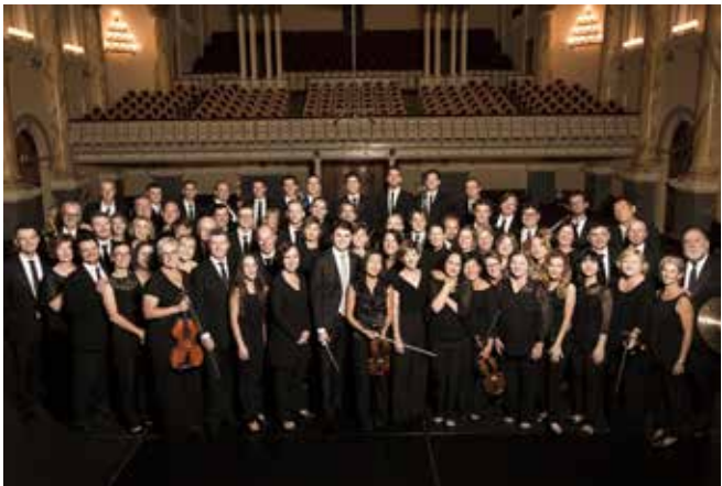
Adelaide Symphony Orchestra