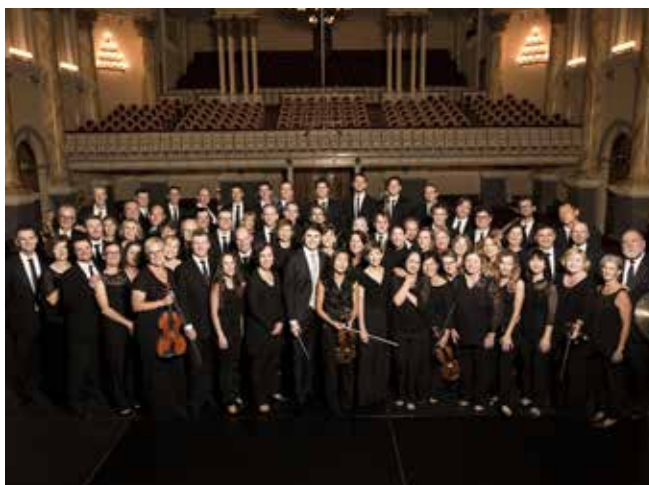
Adelaide Symphony Orchestra