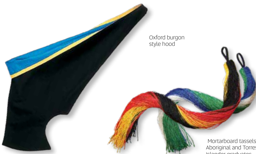
Oxford burgon style hood

The University of South Australia is proud of its commitment to Australian reconciliation. To enable Indigenous Australians to have their ancestry recognised, Aboriginal and Torres Strait Islander graduates have the option of wearing a mortarboard with a tassel incorporating the colours of the respective flags (red, black and yellow for Aboriginal graduates and blue, green and white for Torres Strait Islander graduates).