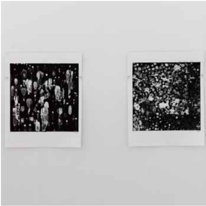
Talitha Benson Untitled, 2021. Monotype.