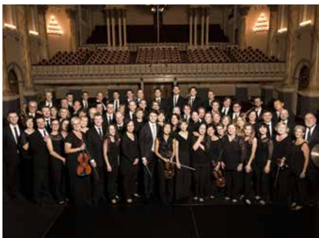
Adelaide Symphony Orchestra