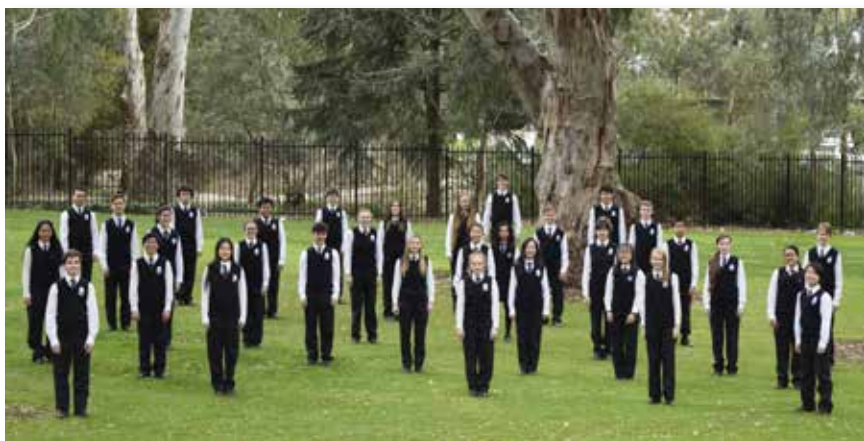
The Marryatville Concert Choir