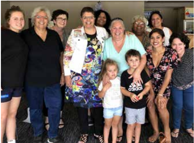
The Ngarrindjeri Women's Choir