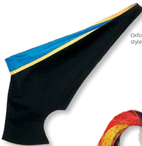
Oxford burgon style hood

The University of South Australia is no exception. In 1991, the University acknowledged the academic dress of its predecessor institutions and then in February 1992, the University's academic dress was determined by the Council and the first graduation ceremonies wearing the new University of South Australia academic dress occurred during April 1992. It is interesting to note that the hood chosen is of Oxford Burgon style while the gown is of the Cambridge style, an interesting link with two of the greatest European universities of the Middle Ages.