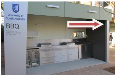
Diagram 1. Gas Shut Off Switch Location