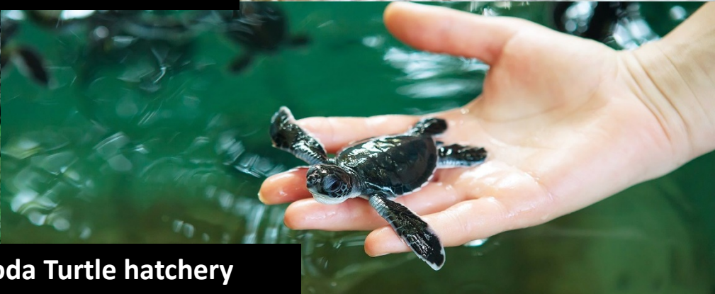
Kosgoda Turtle hatchery