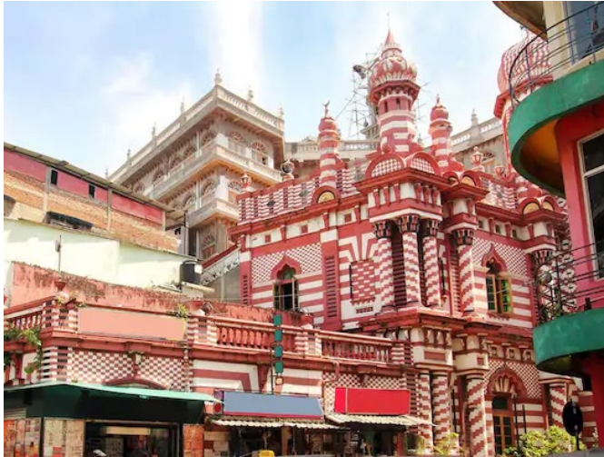
Colombo city tour